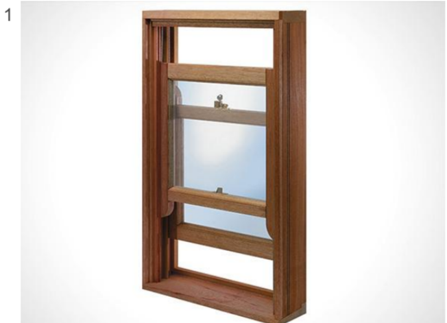
PROPOSED TIMBER FRAME WINDOWS AND DOORS