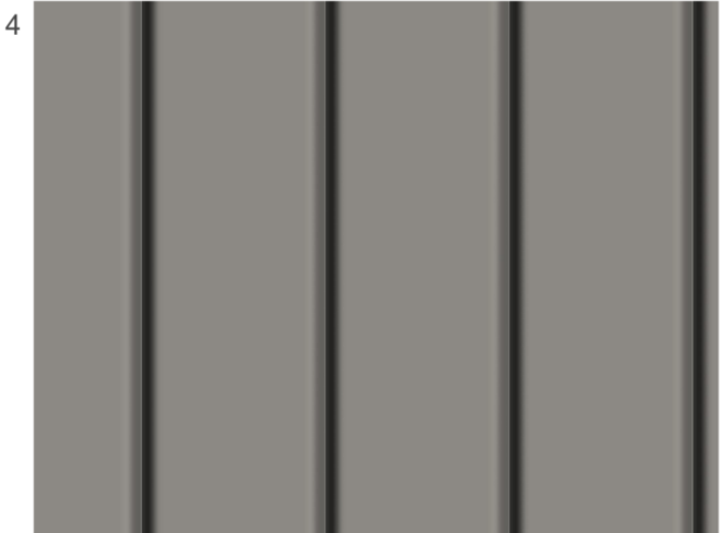
PROPOSED WALL CLADDING JAMES HARDIE STRIA IN WALLABY