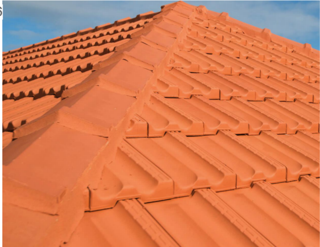
EXISTING DWELLING ROOFING TERRACOTTA TILE